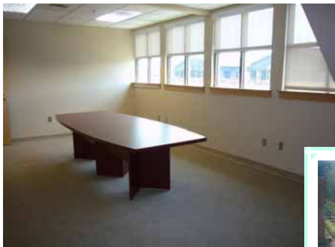
Office With View of Carroll Creek